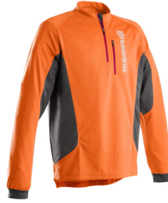
WORK T-SHIRT LONG SLEEVE, TECHNICAL 501 72 03-50