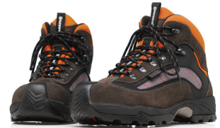
PROTECTIVE BOOTS TECHNICAL 575 35 47-36