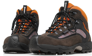
PROTECTIVE BOOTS TECHNICAL 575 35 47-42