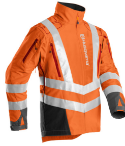
BRUSHCUTTING- AND TRIMMER JACKET, HIGH VIZ 597 24 59-62