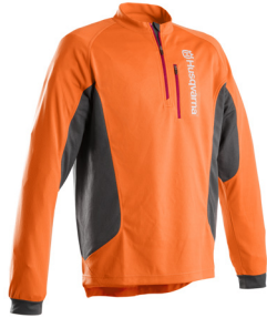
WORK T-SHIRT LONG SLEEVE, TECHNICAL 501 72 03-62