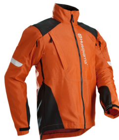
BRUSHCUTTING- AND TRIMMER JACKET, TECHNICAL 580 68 82-58