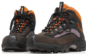
PROTECTIVE BOOTS TECHNICAL 575 35 47-37