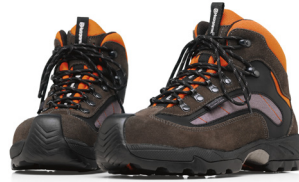
PROTECTIVE BOOTS TECHNICAL 575 35 47-43