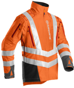
BRUSHCUTTING- AND TRIMMER JACKET, HIGH VIZ 597 24 59-50