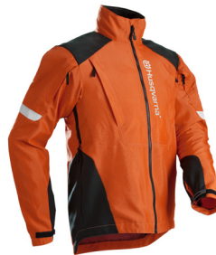
BRUSHCUTTING- AND TRIMMER JACKET, TECHNICAL 580 68 82-46