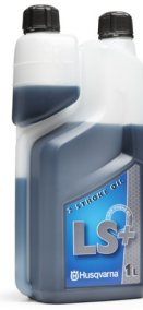
TWO STROKE OIL, LS+ 578 03 70-02