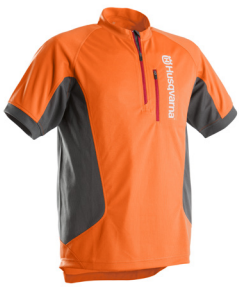
WORK T-SHIRT SHORT SLEEVE, TECHNICAL 501 71 59-66