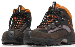
PROTECTIVE BOOTS TECHNICAL 575 35 47-39