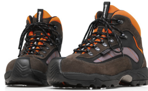
PROTECTIVE BOOTS TECHNICAL 575 35 47-46