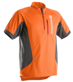
WORK T-SHIRT SHORT SLEEVE, TECHNICAL 501 71 59-62