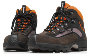
PROTECTIVE BOOTS TECHNICAL 575 35 47-47