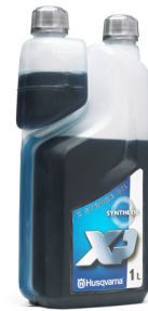
TWO STROKE OIL, XP® SYNTHETIC 578 03 70-03