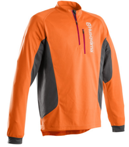
WORK T-SHIRT LONG SLEEVE, TECHNICAL 501 72 03-54