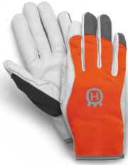
GLOVES, CLASSIC LIGHT 579 38 00-07