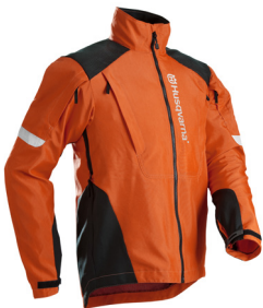
BRUSHCUTTING- AND TRIMMER JACKET, TECHNICAL 580 68 82-54