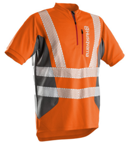
WORK T-SHIRT HIGH VIZ, TECHNICAL 501 72 05-54