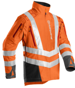
BRUSHCUTTING- AND TRIMMER JACKET, HIGH VIZ 597 24 59-58