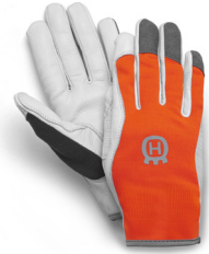
GLOVES, CLASSIC LIGHT 579 38 00-10