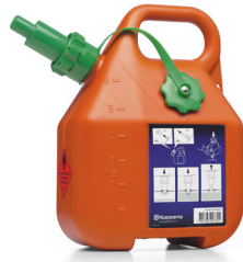
PETROL CAN 6 LITRES, ORANGE 505 69 80-01