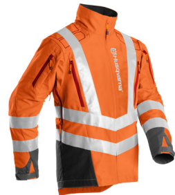
BRUSHCUTTING- AND TRIMMER JACKET, HIGH VIZ 597 24 59-46