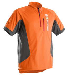
WORK T-SHIRT SHORT SLEEVE, TECHNICAL 501 71 59-46