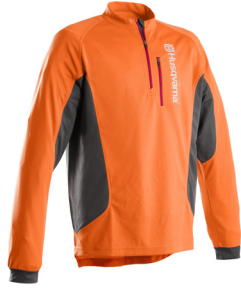
WORK T-SHIRT LONG SLEEVE, TECHNICAL 501 72 03-46