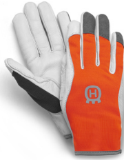
GLOVES, CLASSIC LIGHT 579 38 00-08