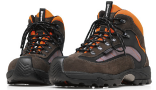
PROTECTIVE BOOTS TECHNICAL 575 35 47-44