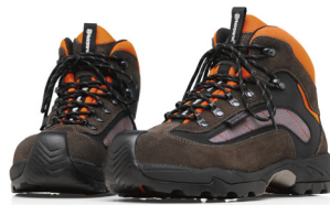
PROTECTIVE BOOTS TECHNICAL 575 35 47-38