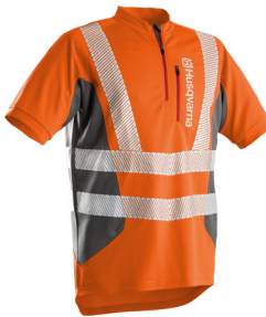
WORK T-SHIRT HIGH VIZ, TECHNICAL 501 72 05-46