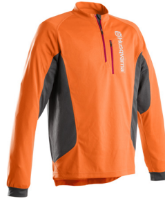
WORK T-SHIRT LONG SLEEVE, TECHNICAL 501 72 03-66