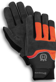
GLOVES, TECHNICAL LIGHT 579 38 06-09