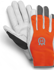
GLOVES, CLASSIC LIGHT 579 38 00-09