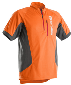
WORK T-SHIRT SHORT SLEEVE, TECHNICAL 501 71 59-54