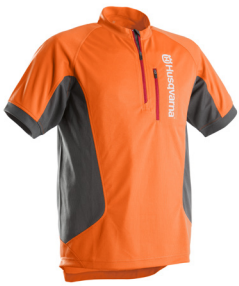
WORK T-SHIRT SHORT SLEEVE, TECHNICAL 501 71 59-50