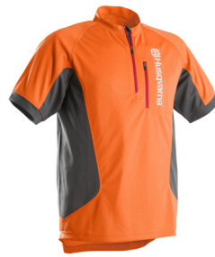
WORK T-SHIRT SHORT SLEEVE, TECHNICAL 501 71 59-58