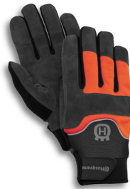
GLOVES, TECHNICAL LIGHT 579 38 06-10