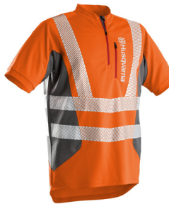
WORK T-SHIRT HIGH VIZ, TECHNICAL 501 72 05-50