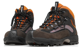
PROTECTIVE BOOTS TECHNICAL 575 35 47-40