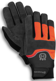
GLOVES, TECHNICAL LIGHT 579 38 06-08