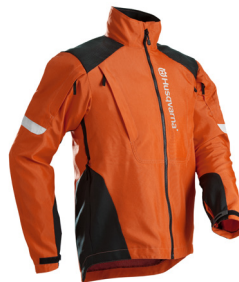
BRUSHCUTTING- AND TRIMMER JACKET, TECHNICAL 580 68 82-62