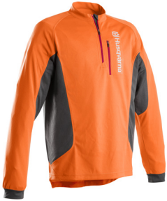
WORK T-SHIRT LONG SLEEVE, TECHNICAL 501 72 03-58