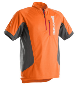
WORK T-SHIRT SHORT SLEEVE, TECHNICAL 50171 59-46