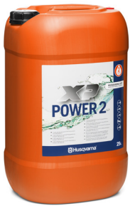
HUSQVARNA XP POWER 2T 582 20 20-03