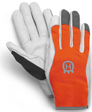
GLOVES, CLASSIC LIGHT 579 38 00-10