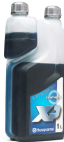
TWO STROKE OIL, XP® SYNTHETIC 578 18 00-03