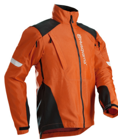
BRUSHCUTTING- AND TRIMMER JACKET, TECHNICAL 580 68 82-58