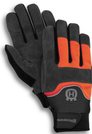
GLOVES, TECHNICAL LIGHT 579 38 06-09