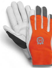
GLOVES, CLASSIC LIGHT 579 38 00-09