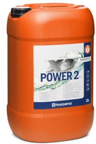
HUSQVARNA XP POWER 2T 583 95 29-02