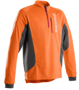
WORK T-SHIRT LONG SLEEVE, TECHNICAL 50172 03-54