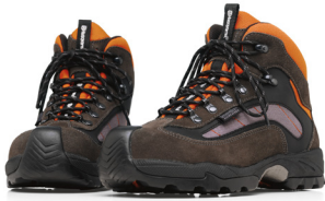
PROTECTIVE BOOTS TECHNICAL 575 35 47-45