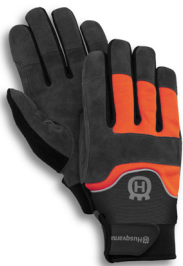
GLOVES, TECHNICAL LIGHT 579 38 06-08