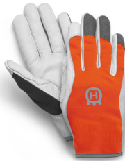
GLOVES, CLASSIC LIGHT 579 38 00-08