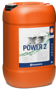
HUSQVARNA XP POWER 2T 582 20 20-13