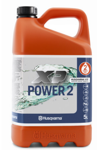
HUSQVARNA XP POWER 2T 589 22 76-10