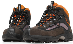
PROTECTIVE BOOTS TECHNICAL 575 35 47-46