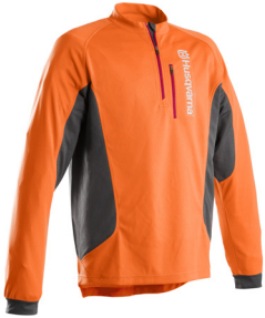
WORK T-SHIRT LONG SLEEVE, TECHNICAL 50172 03-58