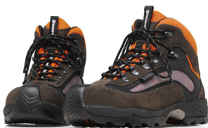
PROTECTIVE BOOTS TECHNICAL 575 35 47-37