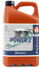
HUSQVARNA XP POWER 2T 583 95 29-01