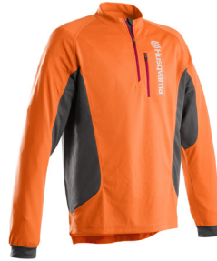
WORK T-SHIRT LONG SLEEVE, TECHNICAL 50172 03-66