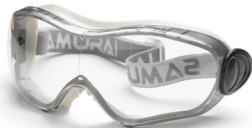
PROTECTIVE GLASSES, GOGGLES 544 96 39-01