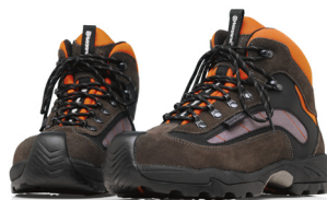
PROTECTIVE BOOTS TECHNICAL 575 35 47-38