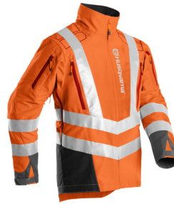
BRUSHCUTTING- AND TRIMMER JACKET, HIGH VIZ 597 24 59-62