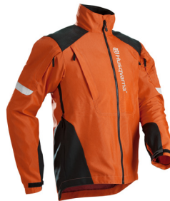
BRUSHCUTTING- AND TRIMMER JACKET, TECHNICAL 580 68 82-46