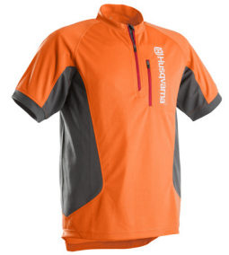
WORK T-SHIRT SHORT SLEEVE, TECHNICAL 50171 59-62