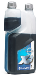
TWO STROKE OIL, XP® SYNTHETIC 578 03 70-03