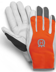
GLOVES, CLASSIC LIGHT 579 38 00-07