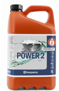
HUSQVARNA XP POWER 2T 581 48 33-01