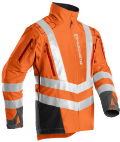
BRUSHCUTTING- AND TRIMMER JACKET, HIGH VIZ 597 24 59-50