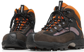
PROTECTIVE BOOTS TECHNICAL 575 35 47-43