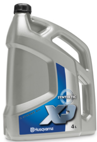
TWO STROKE OIL, XP® SYNTHETIC 578 03 71-03