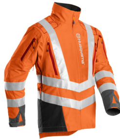
BRUSHCUTTING- AND TRIMMER JACKET, HIGH VIZ 597 24 59-58