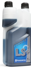
TWO STROKE OIL, LS+ 578 03 70-02