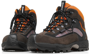
PROTECTIVE BOOTS TECHNICAL 575 35 47-41