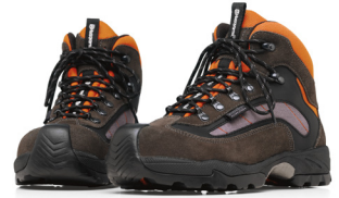
PROTECTIVE BOOTS TECHNICAL 575 35 47-44