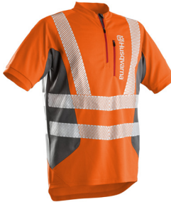
WORK T-SHIRT HIGH VIZ, TECHNICAL 50172 05-46