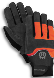
GLOVES, TECHNICAL LIGHT 579 38 06-10