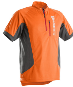
WORK T-SHIRT SHORT SLEEVE, TECHNICAL 50171 59-58