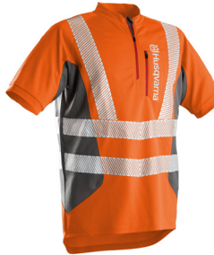
WORK T-SHIRT HIGH VIZ, TECHNICAL 50172 05-50