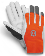
GLOVES, CLASSIC LIGHT 579 38 00-06