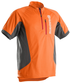
WORK T-SHIRT SHORT SLEEVE, TECHNICAL 50171 59-50