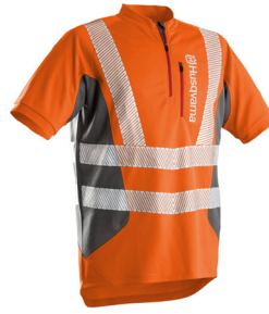
WORK T-SHIRT HIGH VIZ, TECHNICAL 501 72 05-66