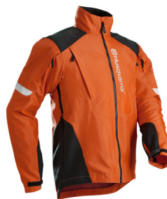
BRUSHCUTTING- AND TRIMMER JACKET, TECHNICAL 580 68 82-62