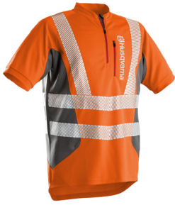
WORK T-SHIRT HIGH VIZ, TECHNICAL 501 72 05-58