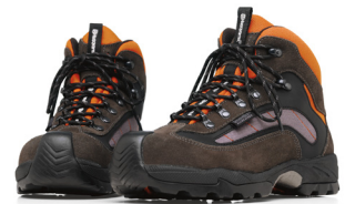
PROTECTIVE BOOTS TECHNICAL 575 35 47-36