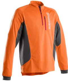
WORK T-SHIRT LONG SLEEVE, TECHNICAL 50172 03-62