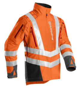
BRUSHCUTTING- AND TRIMMER JACKET, HIGH VIZ 597 24 59-46