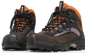
PROTECTIVE BOOTS TECHNICAL 575 35 47-47