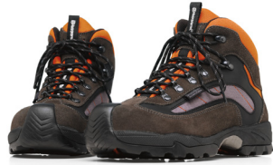
PROTECTIVE BOOTS TECHNICAL 575 35 47-42