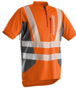
WORK T-SHIRT HIGH VIZ, TECHNICAL 501 72 05-62