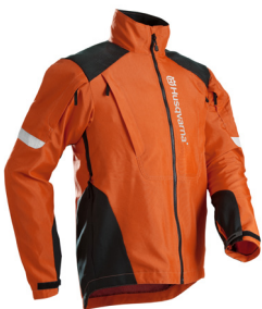
BRUSHCUTTING- AND TRIMMER JACKET, TECHNICAL 580 68 82-54