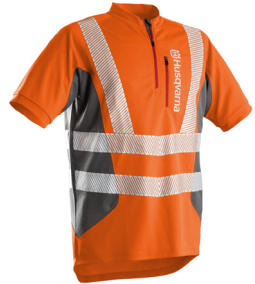
WORK T-SHIRT HIGH VIZ, TECHNICAL 50172 05-54