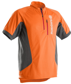
WORK T-SHIRT SHORT SLEEVE, TECHNICAL 50171 59-54