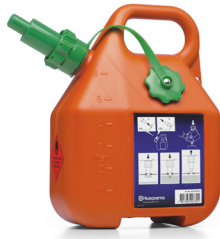
PETROL CAN 6 LITRES, ORANGE 505 69 80-01