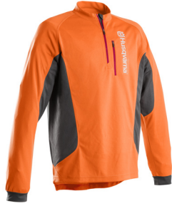
WORK T-SHIRT LONG SLEEVE, TECHNICAL 50172 03-46