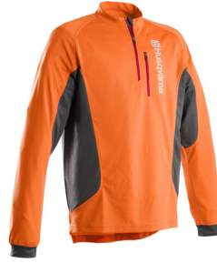
WORK T-SHIRT LONG SLEEVE, TECHNICAL 50172 03-50