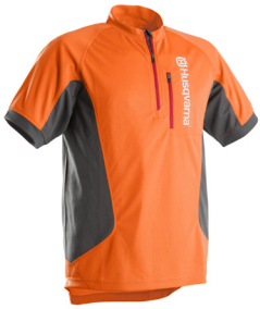
WORK T-SHIRT SHORT SLEEVE, TECHNICAL 50171 59-66