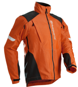
BRUSHCUTTING- AND TRIMMER JACKET, TECHNICAL 580 68 82-50