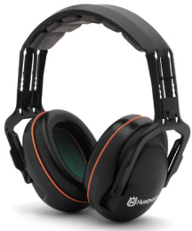
HEARING PROTECTION 505 66 53-04