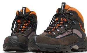
PROTECTIVE BOOTS TECHNICAL 575 35 47-39