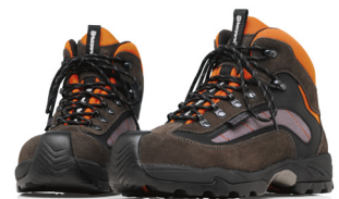
PROTECTIVE BOOTS TECHNICAL 575 35 47-40